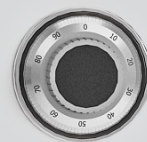
Mechanical code lock