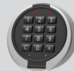
Elektronic lock - Primor 3000 level 5