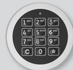
Elektronic lock - Stellar Business