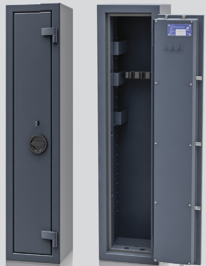
56477.11 Key lock RAL 7024