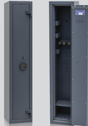
56478.11 Key lock RAL 7024