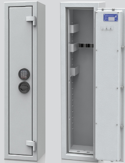
56477.02 Elektronic lock Stellar Basic RAL 7035