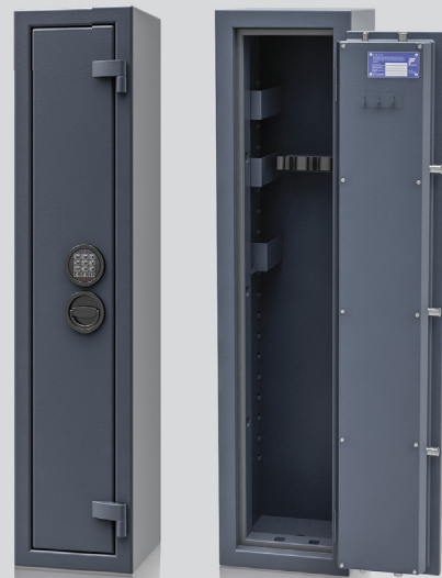
56477.12 Elektronic lock Stellar Basic RAL 7024