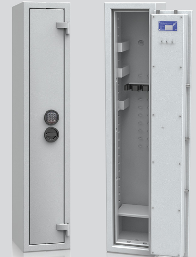
56478.02 Elektronic lock Stellar Basic RAL 7035