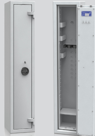
56478.01 Key lock RAL 7035