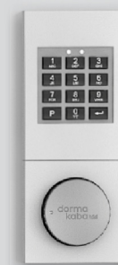
Elektronic lock - B 90