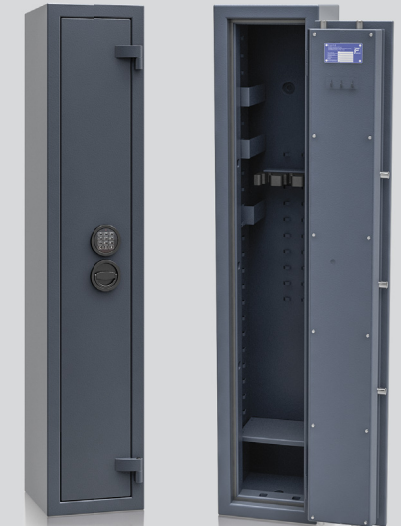
56478.12 Elektronic lock Stellar Basic RAL 7024