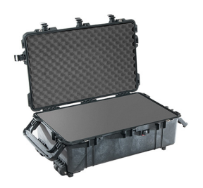
1670WF With Foam