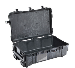
1670NF No Foam