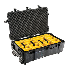
1674 With Padded Dividers