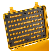
1560MP EZ-Click™ MOLLE Panel