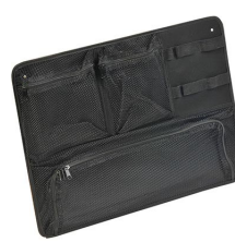
1569 Lid Organizer