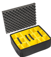
1565 Padded Divider Set