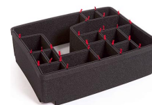
1560EUTP TrekPak Case Divider Kit