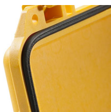
0343 Replacement O-ring