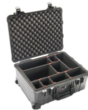
1560TP With TrekPak Divider System